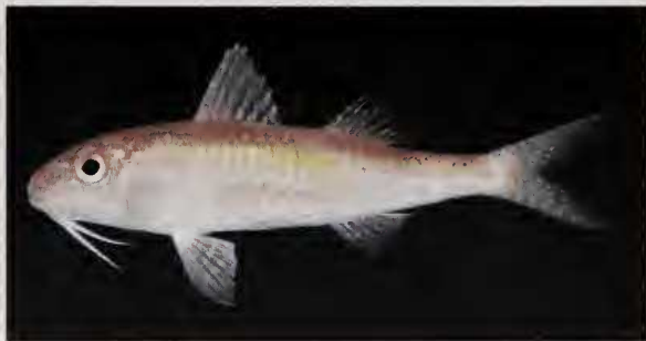
Fig. 5. Holotype of Parupeneus minys , BPBM 35553, 70 mm SL, Poivre Atoll, Amirantes, Seychelles, 43–48 m.

Parupeneus heptacanthus (non Lacepède) Randall 2004: